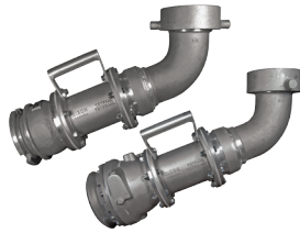
Cam and Groove Fittings Railcar unloading assemblies