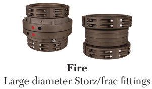
Fire Large diameter Storz/frac fittings