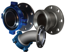
Boss LPS Fittings One-piece flange adapters and hammer union nuts

Visit dixonvalve.com to order or download your copy of the 2014 Dixon Price List. Dixon: The Right Connection for quality, service and innovation.